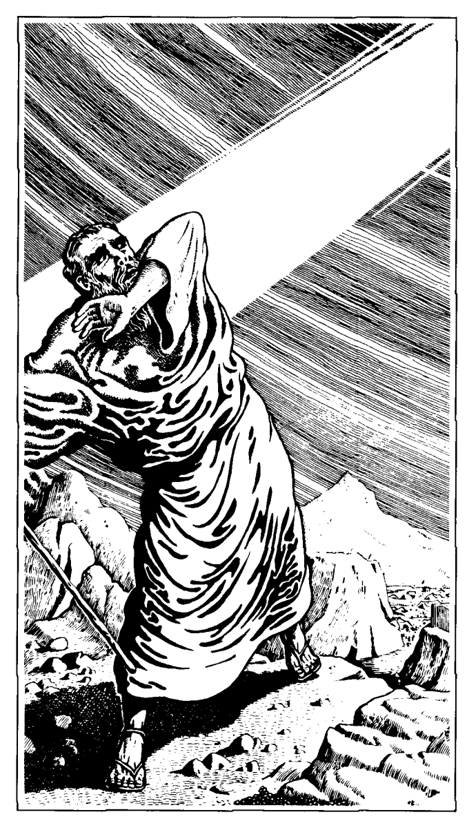
God fulfilled His promises to obedient Abraham by greatly blessing his modern-day descendants.

bestowed (Genesis 48). And as a careful study of history shows, the modern-day descendants of Ephraim and Manasseh—formerly the leading tribes of the house of Israel—are Britain and the United States today.