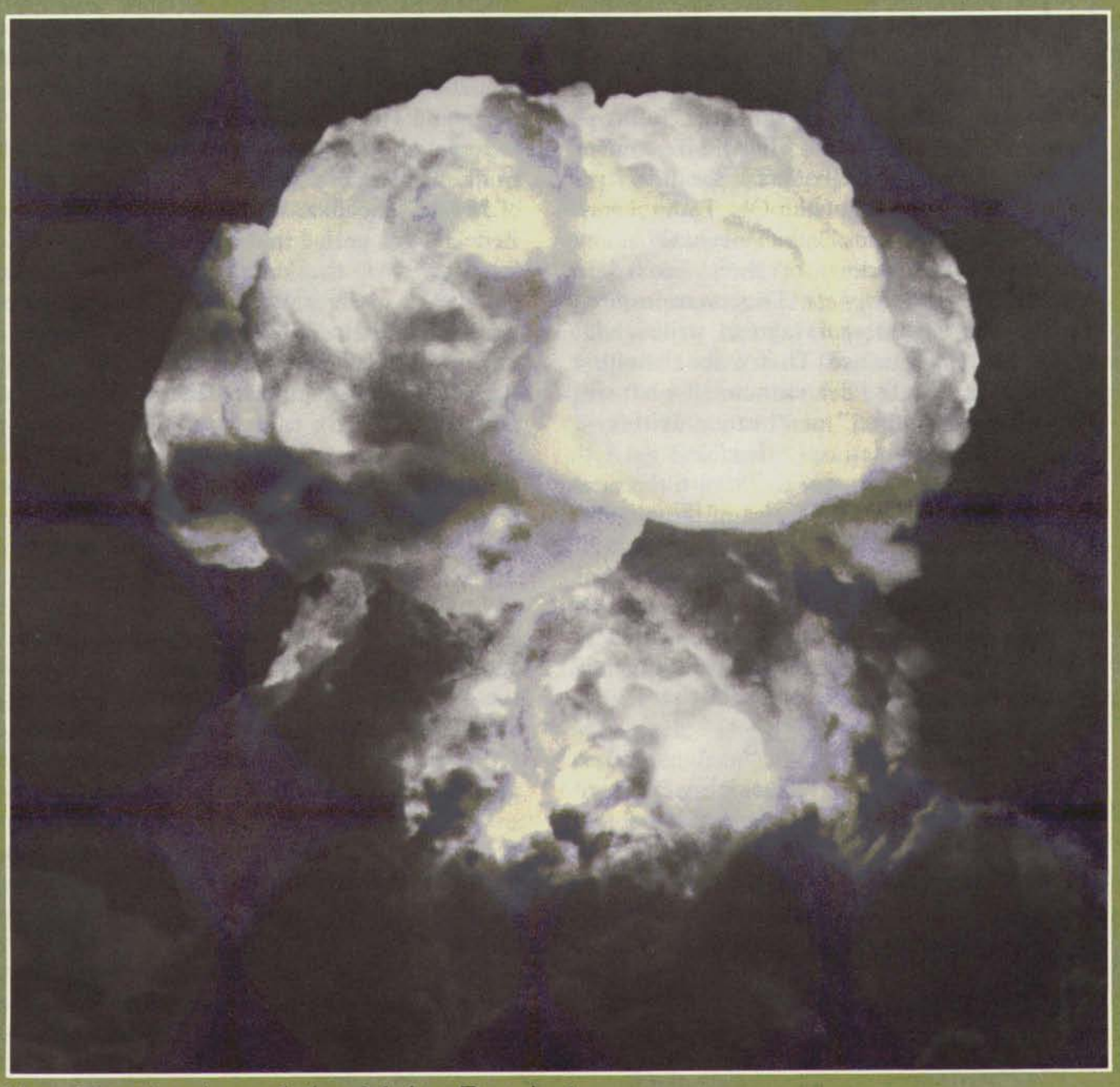
Key Prophecies of the Major Prophets