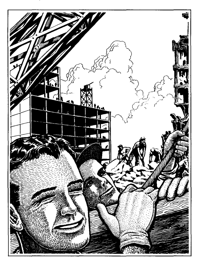
The devastated cities will be rebuilt after Jesus Christ returns to earth.

God will even change the natures of wild animals, as we find in Isaiah 11:6: "The